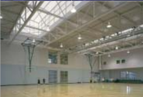
Above Left Oregon State University, Reser Stadium Expansion, Corvallis, OR Above Glendale Arena, Multi-use Arena, Glendale, AZ Above Right University of San Diego, Jenny Craig Pavilion, San Diego, CA